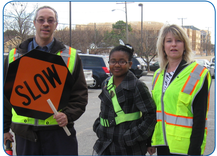
Park View Elementary School in Portsmouth used a QuickStart Mini-grant to purchase safety equipment.