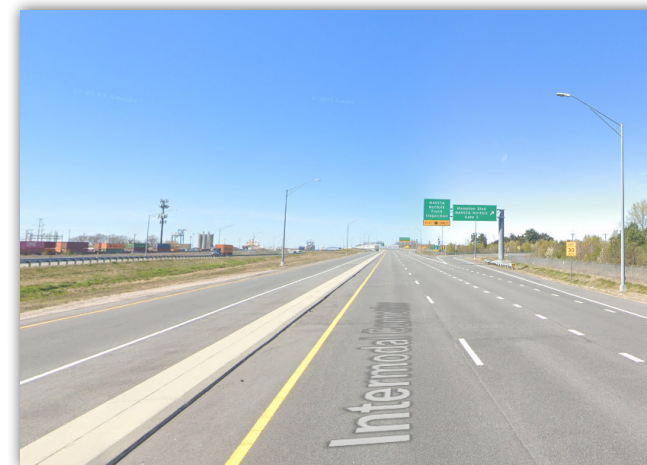
Westbound Intermodal Connector approaching Public Connector Road